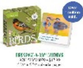
1 - $18