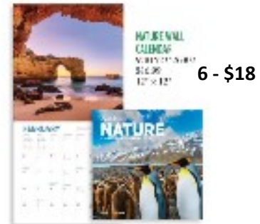
6 - $18