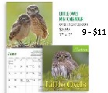
9 - $11

Immerse yourself in the beauty of the natural world with the 2025 Audubon Calendar Collection! Experience vibrant, full-color photographs for each day, week or month paired with insightful text from nature experts. Every purchase supports the Wachiska Audubon Society's vital mission to protect birds and the places they need.