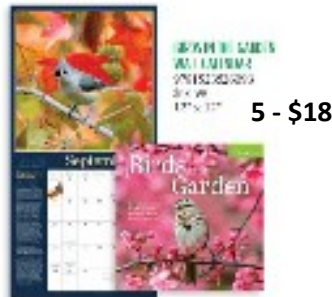
5 - $18