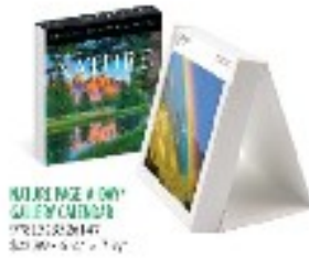
2 - $24