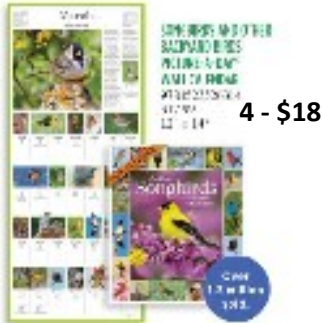
4 - $18