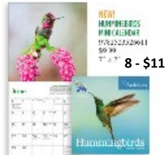
8 - $11