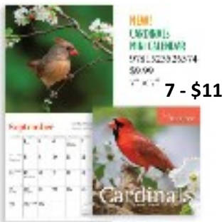
7 - $11