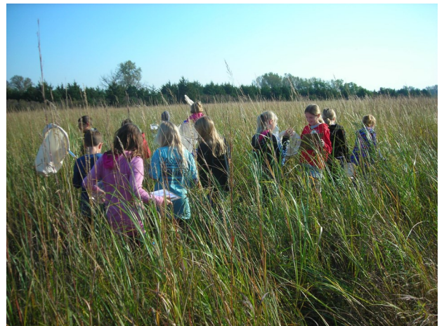
The Babbling Brook