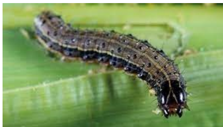
Fall Army Worm

Social media again gave Nebraskans an indication of the potential for infestations as early as July. When egg masses were first detected in eastern Nebraska, turfgrass managers were alerted via a subscription service (TurfiNfo). Extension faculty were quick to share this information with affected parties, so turf loss associated with a similar infestation more than 20 years ago was largely averted. Lesson learned.