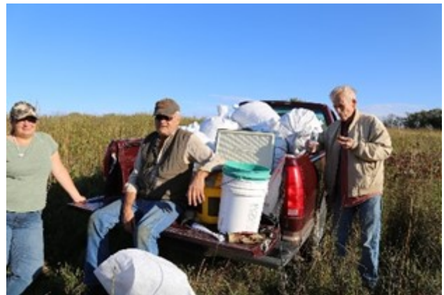
Rousek Gayfeather Harvest