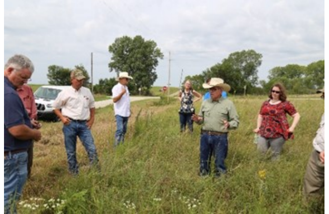
Environmental Trust Committee at Beethe Prairie