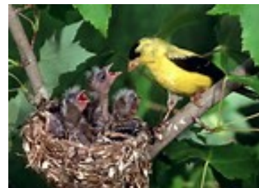
American Goldfinch Family

Please note: If you are already a member of National Audubon Society (NAS) you automatically become a member of Wachiska, but not a Wachiska Friend member. Only Wachiska Friends receive the printed newsletter each month. If you wish to join NAS or receive Audubon magazine, please contact the National Audubon Society directly.