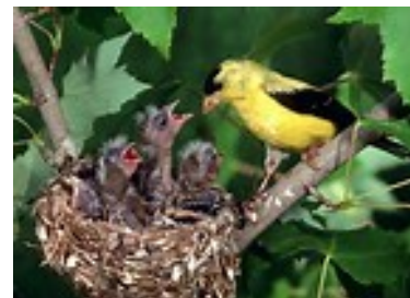
American Goldfinch family

Please note: If you are already a member of National Audubon Society (NAS) you automatically become a member of Wachiska, but not a Wachiska Friend member. Only Wachiska Friends receive the printed monthly newsletter each month. If you wish to join NAS or receive Audubon magazine, please contact National Audubon Society directly.